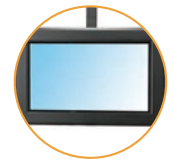
Ceiling (DGA110s accessory required)