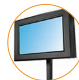
Floor Stand (DGA105s accessory required)