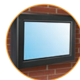
Wall (included - standard models only)